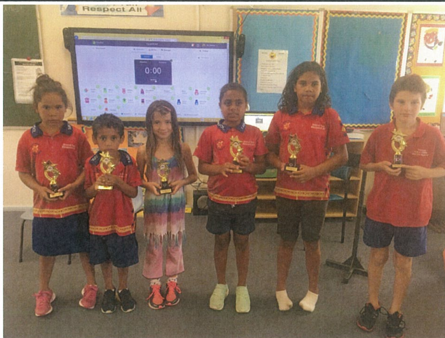
Our Champions and Runners Up for the 2017 Maths Challenge.